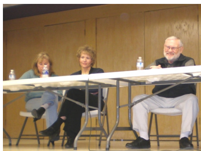
Panelists discuss their relationships at the CAAN sponsored Marriage Forum in Plainfield, IL

VICTORY: Thanks to all who called and emailed the Illinois Senate Judiciary Committee. Thanks to you SB 3447 did NOT get called. This bill would have carved out exceptions to the IL Human Rights Act, allowing certain employees and tax exempt organizations to discriminate against Illinoisan on the basis of sexual orientation, gender identity or religion.